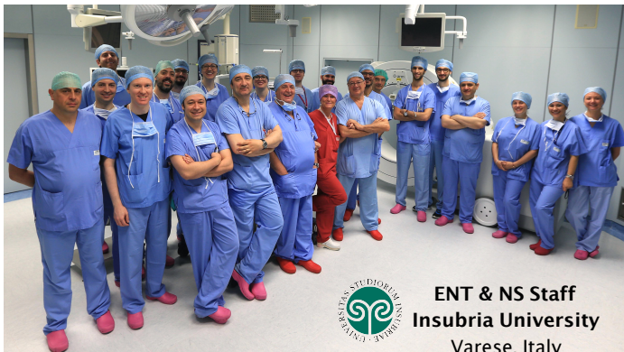
ENT & NS Staff Insubria University Varese, Italy